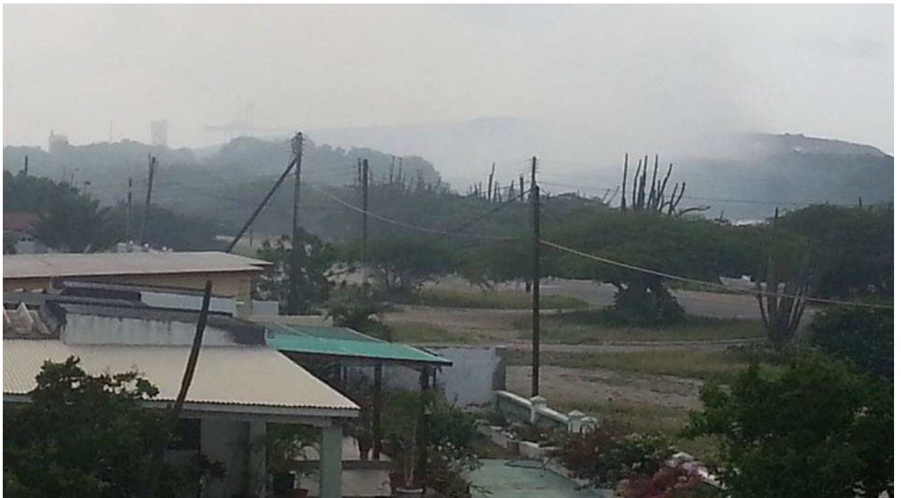
My neighbourhood, homes constantly polluted by toxic smoke