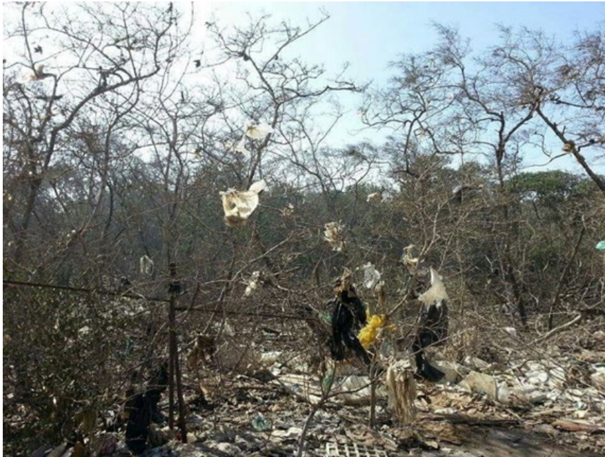
Protected mangroves are dying and sea is being contaminated