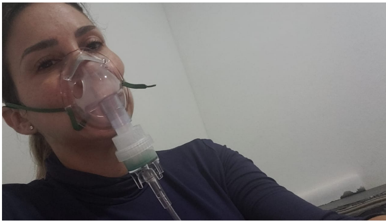
The daily smoke emissions are making us sick, visit at the doctor