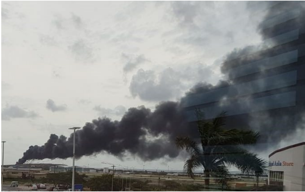
View from far