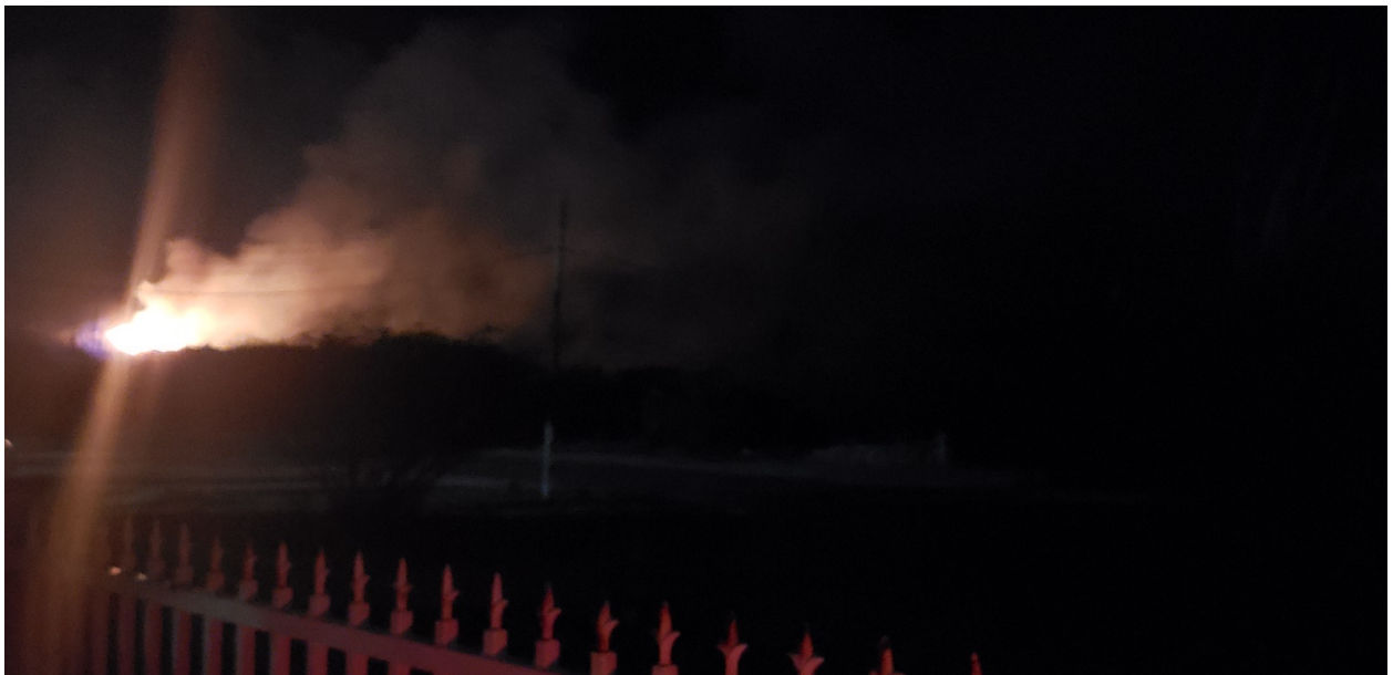
View from my home during night time