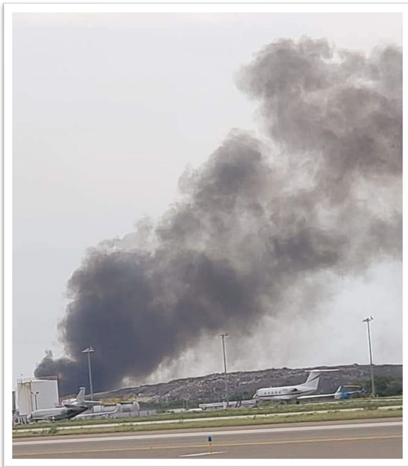
Airport, danger for landing planes