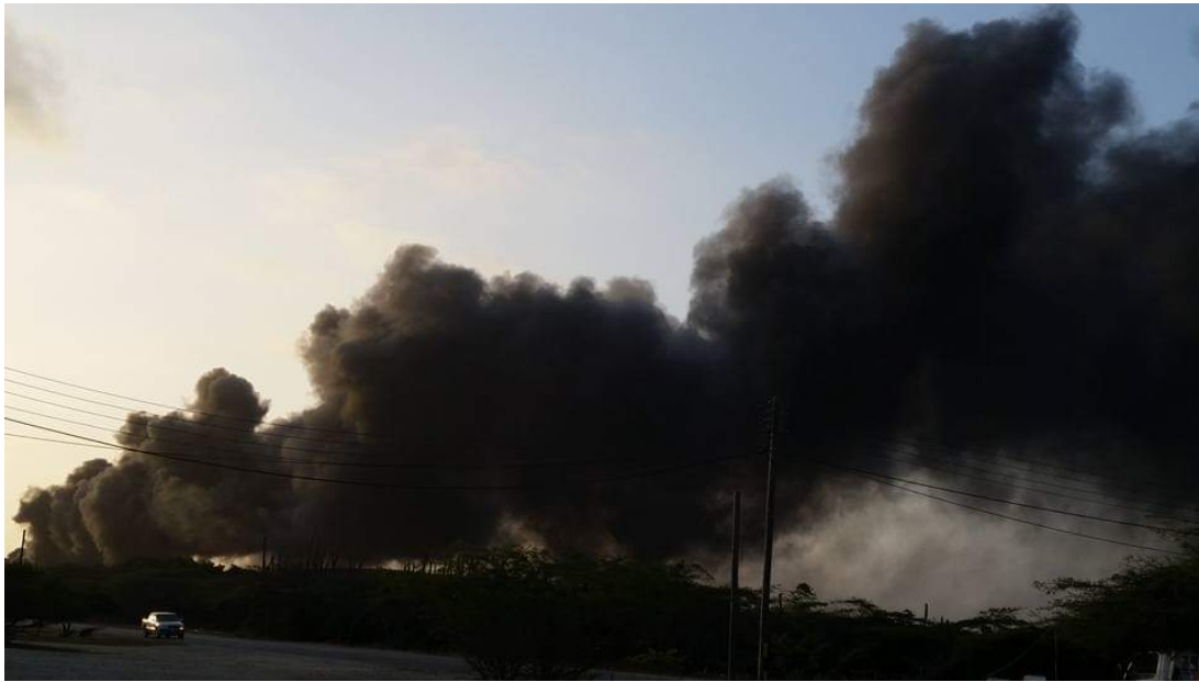
Picture taken in front of my home